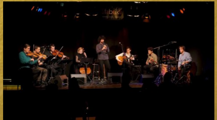
Entremig (with Stringquartet)