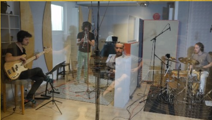
Esperant-te a Sofia